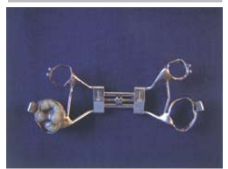
Figure 5. Decoronation of the first permanent molar on removal of the rapid maxillary expansion (RME) device.