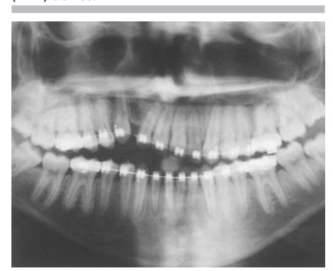
Figure 6. Ankylosis of the upper right canine during orthodontic alignment with fixed appliances and consequent severe disruption of the occlusal plane.

consent and it makes no difference whether a form is signed by a patient to indicate his/her consent or whether it is given orally or nonverbally. Also, English law does not directly prescribe a threshold above which a formal conversation between the treatment provider and patient concerning consent should occur. However, as a general rule, the more complex the treatment becomes, the greater the need to ensure that the patient has given his/ her consent. The value of a signed consent form is that it provides some evidence of an agreement between the patient and the clinician and, for the sole purpose of defending against negligence claims, signed consent should be mandatory. An important